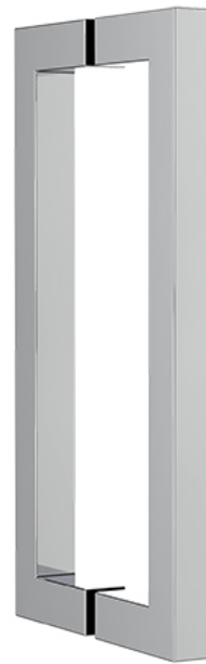
Double Door Handle shown with no Rosette